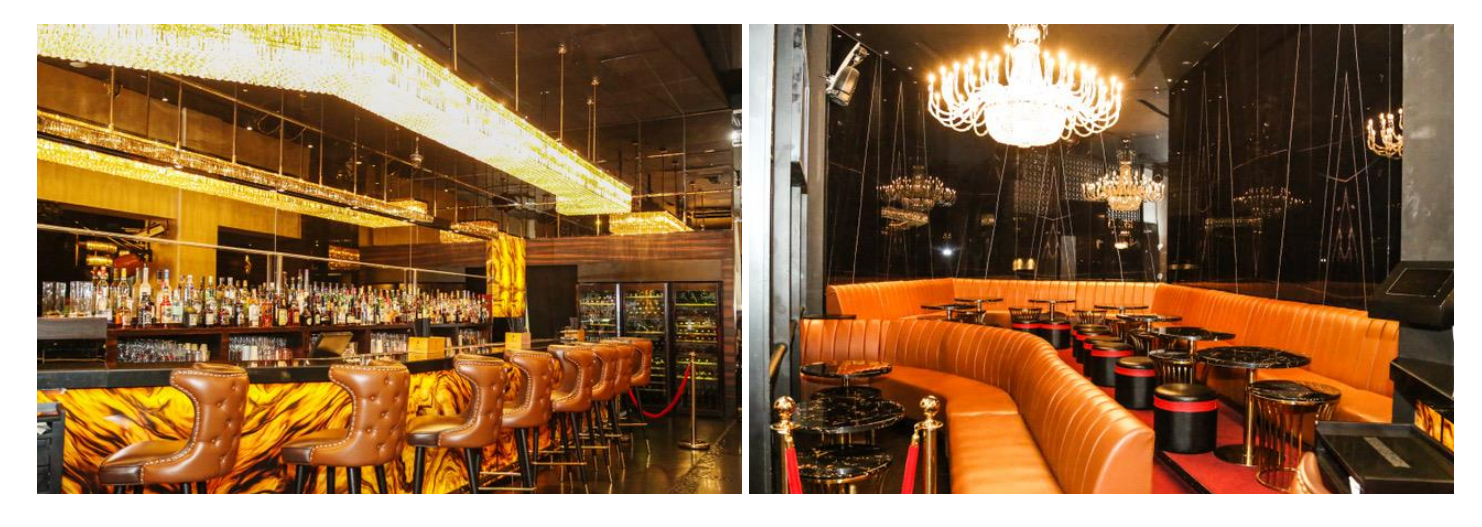
10. OSCAR RESTAURANT: This sophisticated restaurant serves finest Lebanese cuisine in an elegant setting. Located on the first floor, Oscar Restaurant redefines luxury dining with live entertainment every night